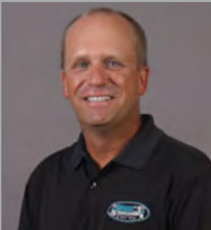
MRCA Board of Directors, Editorial, Conference, and Steep Slope Committees