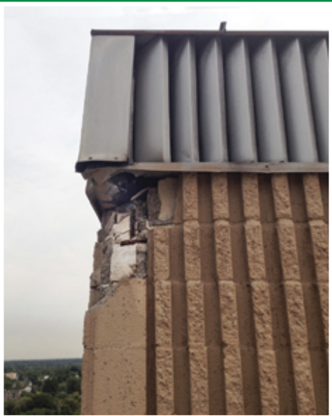
Without a lightning protection system, the lightning attached to the building along the metal parapet. It then arced into the steel reinforcing in the wall, shattered the grout-filled masonry units, and created hazardous falling debris. The power continued to wreck havoc on its way to ground.