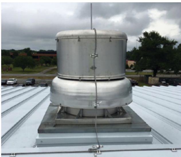
Air terminals must be installed on rooftop equipment that is not within the zone of protection created by air terminals mounted at a higher elevation on the building.

In most buildings, lightning's energy is conveyed from air terminals to the ground through large, multi-strand cables made from highly conductive grades of aluminum or copper; copper should not be used in contact with