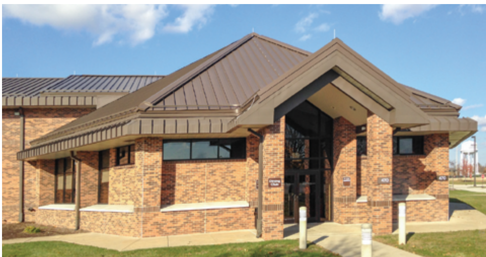
Air terminals must be located at high points and where indicated by NFPA 780. Conductor cables that are exposed to view should be installed along the natural lines of a building to minimize their visual impact.

galvanized steel, aluminum, or most other non-cupreous metal roofing or siding. The cables must interconnect air terminals and bond to metal elements on the roof.