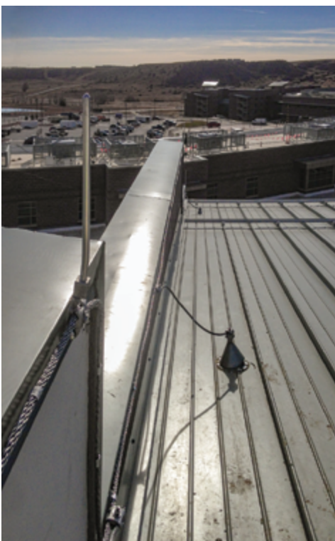
Air terminals are installed on parapets, the highest locations on this roof. Flexible boot flashings are used to seal the through roof penetrations.

A wide variety of air terminal bases and cable fasteners are available for installing LPS components on metal roofs. Screw-installed devices can sometimes be used on ridge caps, and adhesively-mounted devices are available that avoid drilling holes through the roof. On better-quality buildings and in high wind areas, devices that clamp onto a roof's standing seams should be considered. Ideally, the LPS is installed