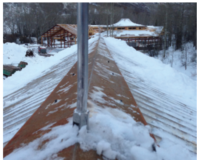
The air terminals on this ridge are supported from below the roof deck and sealed against weather intrusion. They are connected to each other and to ground by conductor cables inside the attic to maintain the design standards of this luxury resort development.